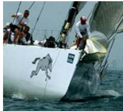
Akela rounds windward mark

Everyone will keep that in mind the next couple of days. Racing will continue Saturday and Sunday starting at noon, conditions permitting.