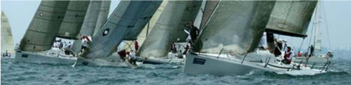
Farr 40s blast off the starting line on the first day of three days of racing at Long Beach