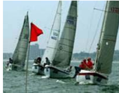
Cal 25s still going strong

"If we'd played the right we wouldn't be tied," he said. "But we love sailing at Long Beach, and the Flying Tiger fleet is a lot of fun. Everyone is real friendly ... no yelling at each other or anything."