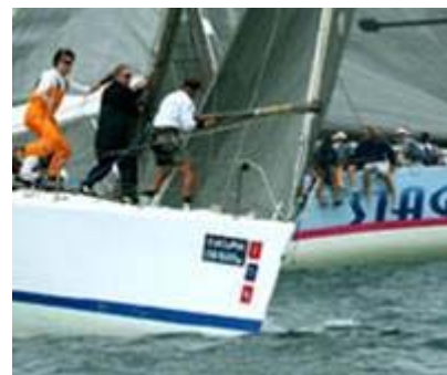
Chayah crosses Staghound and prepares to set spinnaker