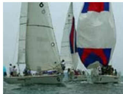
Catalina 37s at a crossroads