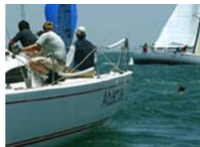
Unidentified crewman (r.) bobs in water after falling off Abacus

LONG BEACH, Calif.---Rough seas, 20 knots of breeze, two injured sailors, two or three people overboard, one busted rudder, a dozen protests at the end of the day and a bunch of new class leaders---when Acura presented Day 2 of Ullman Sails Long Beach Race Week Friday, there was never a dull moment.