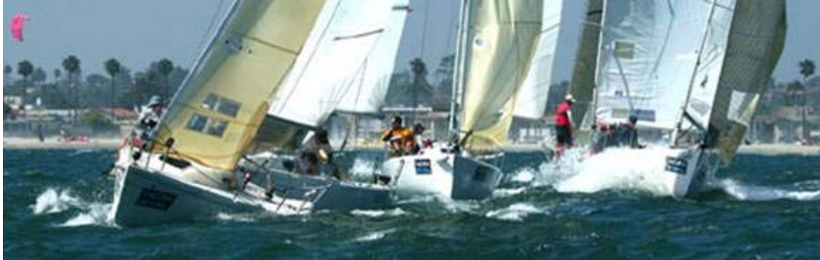
J/80s splash off the starting line on Charlie course near the beach in 20 knots of breeze on Day 2