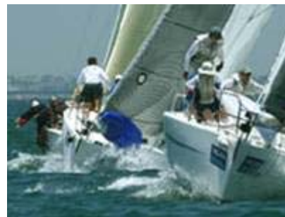
Ullman Sails Inshore Championship standings

High-resolution photos available free to print media