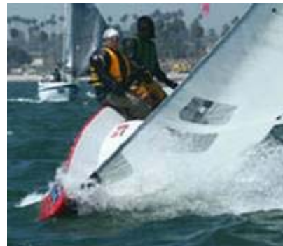
An Open 5.70 was a handful Friday