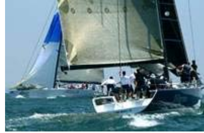
Peligroso (r.) stayed close enough to Akela to hold first place